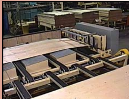
Backstop ensures that the edges of all sheets are aligned.