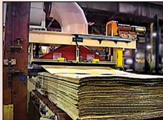
Vacuum head picking up a veneer sheet.

This strategy allows you to run your Dryers faster than at present, because although your wet sheet count increases, your ability to process it without redrying also increases. And when a Westmill™ Redryer is used in your plant, Dryer production increases even more by using this strategy (see Veneer Redryer brochure).