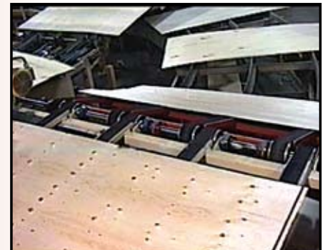
Storage belts and decline section, merging directly onto 90-degree edge belt conveyor.