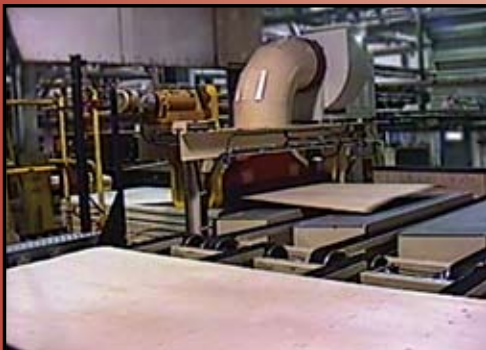
Sheets are fed into fixed skids with jumping belts.

Shown below: 4' (grain direction) Reentry System.